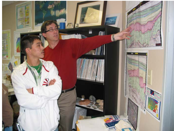
Northern Labrador High School students visit Husky's Office in February 2007