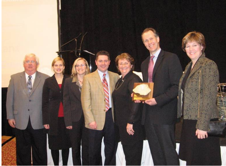
Husky Receives the Employer of Distinction Award from the Newfoundland and Labrador Employers Council on January 31, 2007