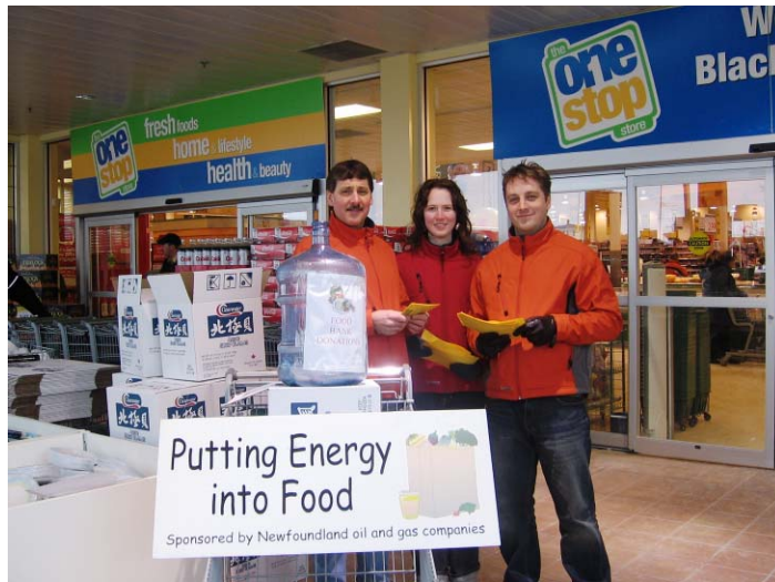
Husky Food Drive Volunteers – March 10, 2007