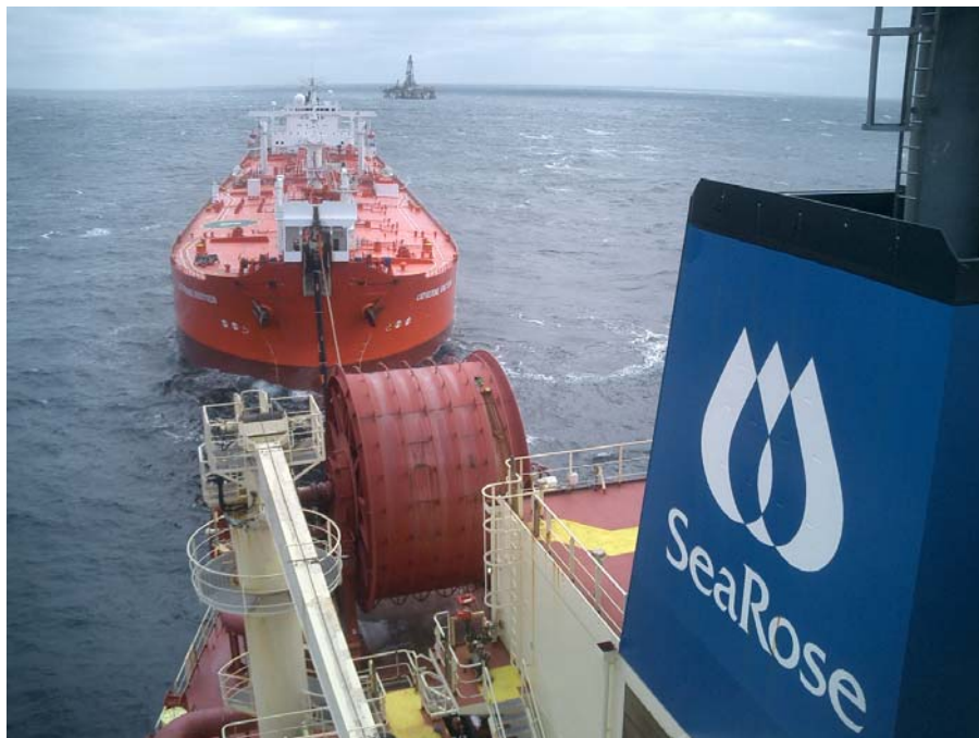
100 th Offload From the SeaRose to the Catherine Knutsen March 31, 2008