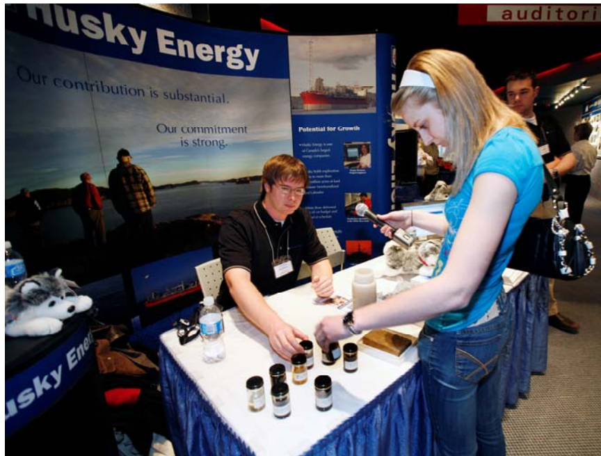
Husky Exhibits at Energy Day During Oil & Gas Week Feb 22, 2008