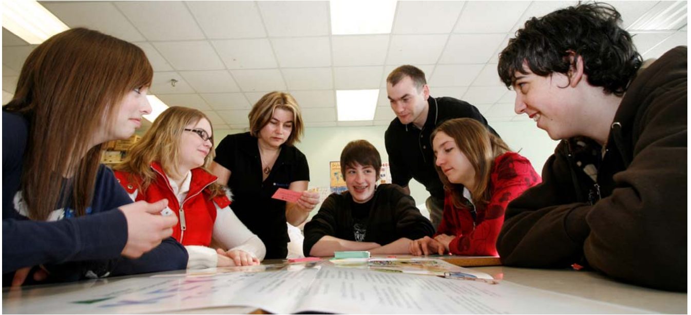
Husky Employees Participate in Junior Achievement - Economics of Staying in School Program at St. Kevin's Junior High School on March 12, 2008