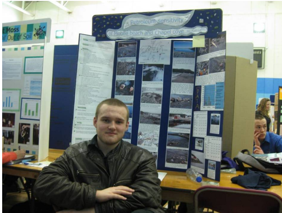
Husky Provided Support for the Eastern Regional High School and Junior High Science Fair in March 2010