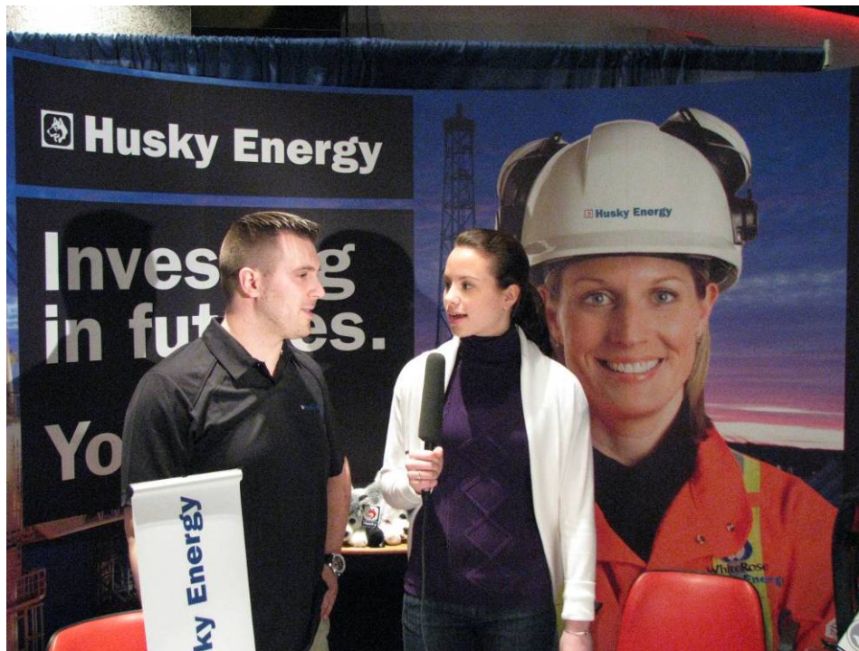
Husky Participates in Energy Day at the Geo Centre February 2010