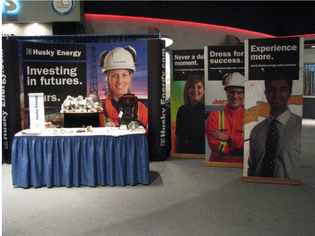
Husky's New Look Exhibition Booth