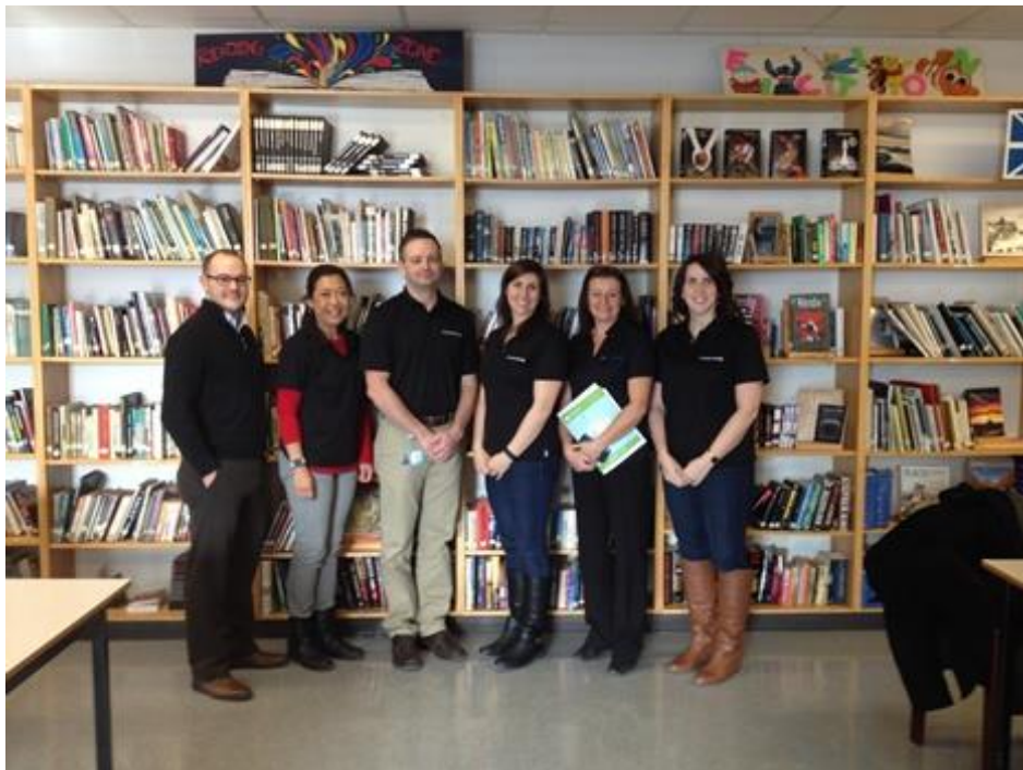
Husky staff provide mentorship in the Junior Achievement Program