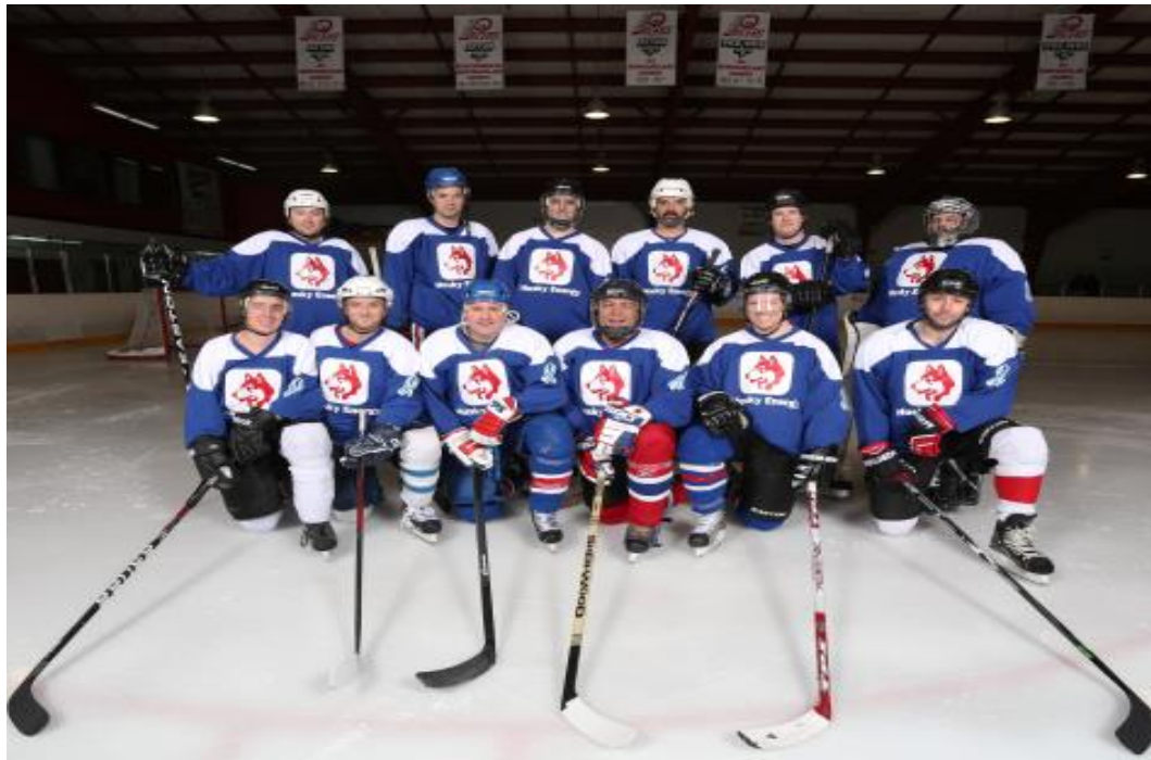
Husky staff participate in the Offshore Workers Memorial Fund Hockey Tournament – March 2016