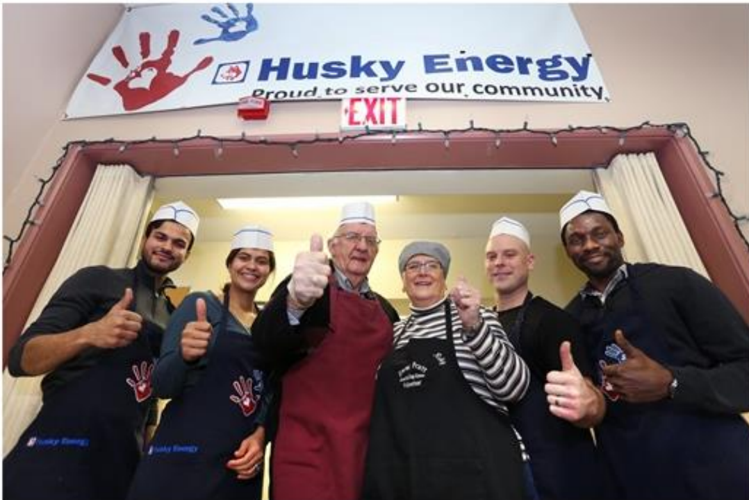
Husky staff volunteer at the Jimmy Pratt Breakfast Program - February 2016