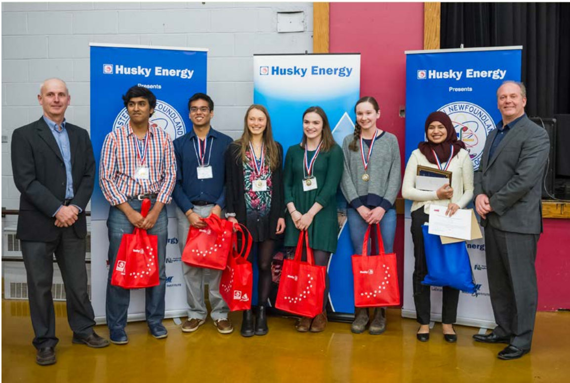
Husky Energy Eastern Science and Technology Fair – April 2016