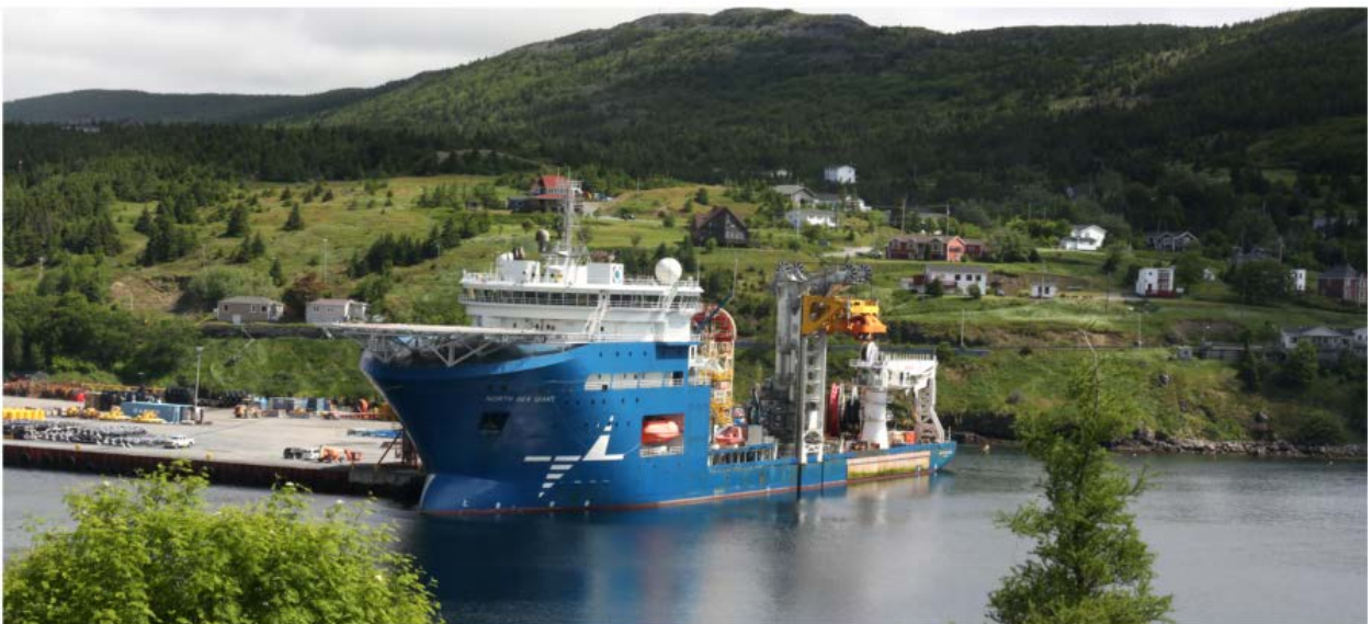
One of the largest and most advanced subsea construction vessels in the world, the North Sea Giant , arrives in Bay Bulls to support the 2016 SeaRose Turnaround – June 2016