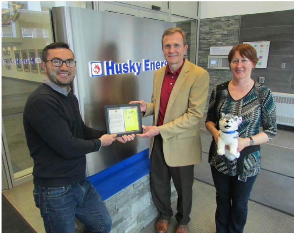
Easter Seals presents Husky with a Plaque of Appreciation– June 2016