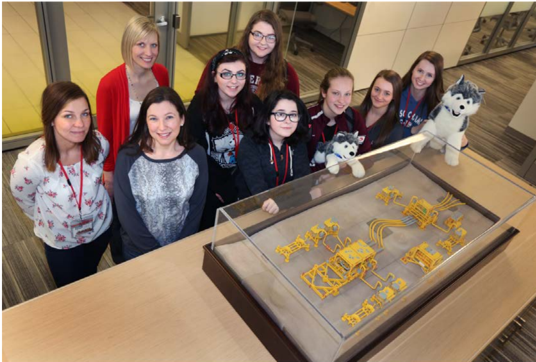
The Techsploration Program tours Husky facilities – April 2016