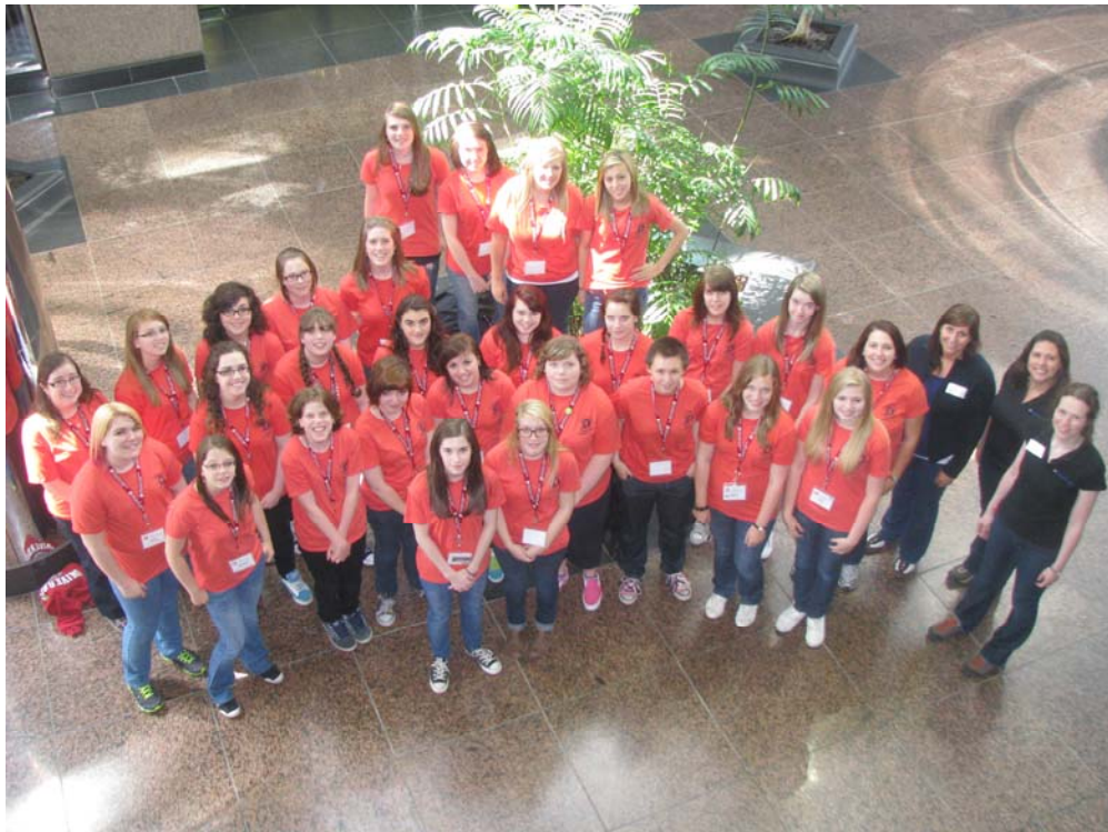
WISE SEEP Program – August 2011