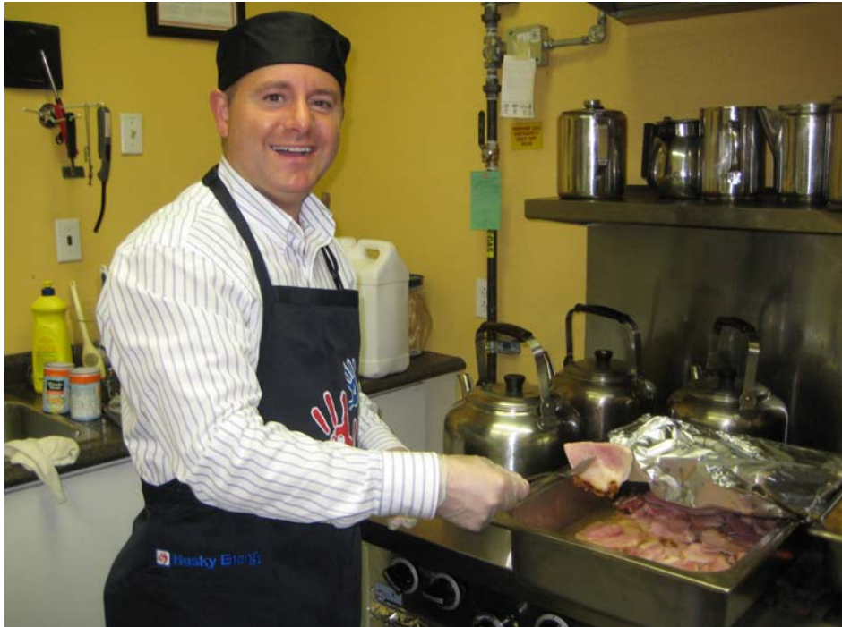
Husky Staff Volunteer at the Jimmy Pratt Centre – September 2011