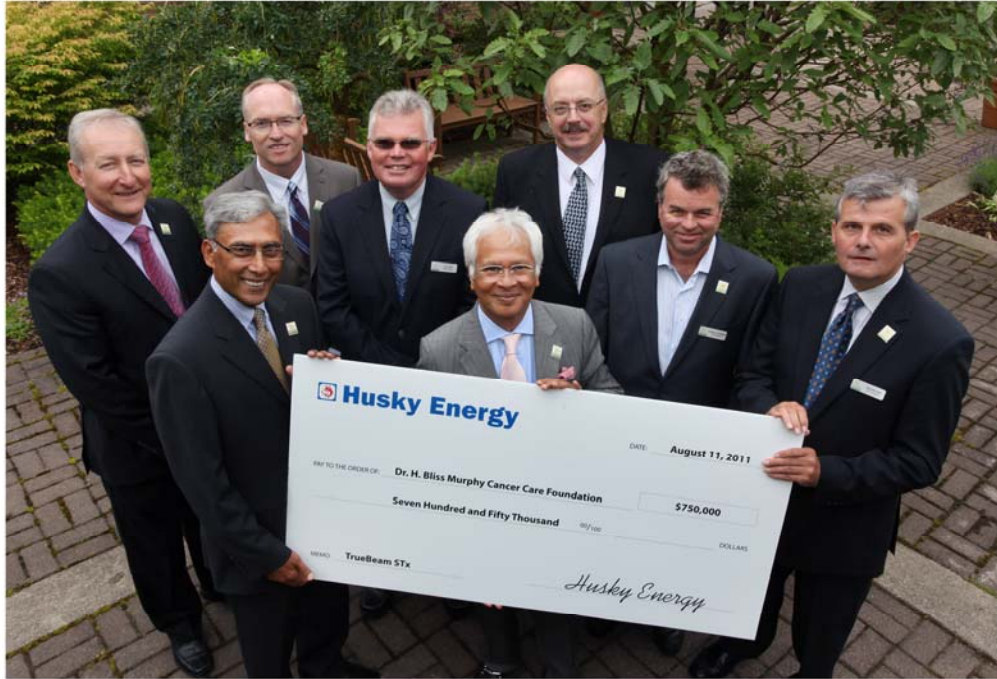
Donation to Bliss Murphy Cancer Care Foundation – August 2011