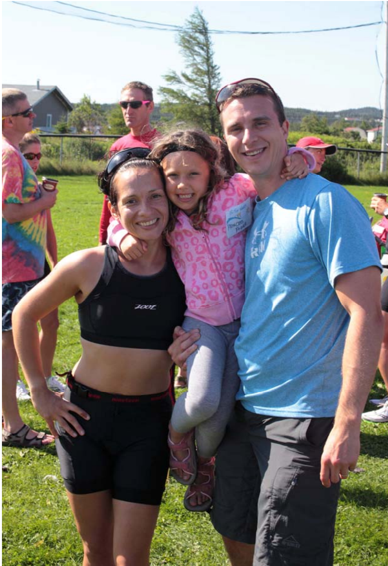
Husky Sponsors the Tri for Health Triathlon Fundraiser for Mental Health - August 2011