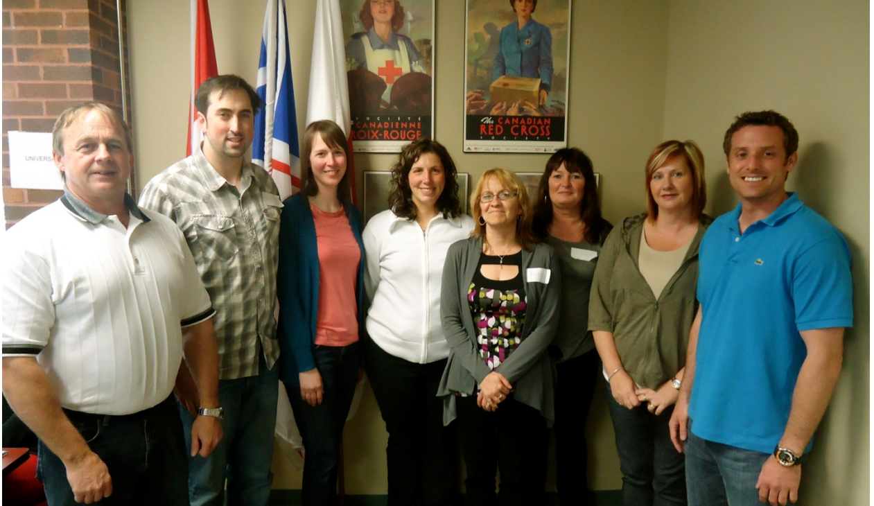
Husky Volunteers for Ready When the Time Comes Training – Canadian Red Cross – July 2012