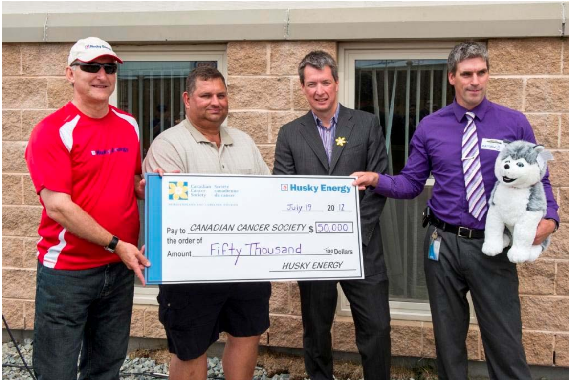
Donation to Daffodil Place – July 2012