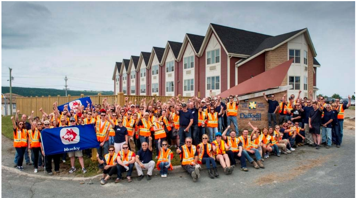
Husky Volunteers at Daffodil Place – July 2012