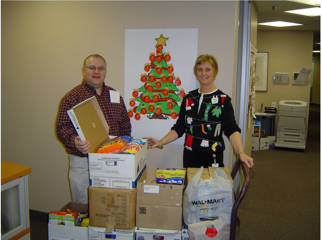
Members of Husky's Drilling and Completions team show off some of the items bought for Christmas food hampers. East Coast Teams raised over $4600 in a Christmas fundraiser