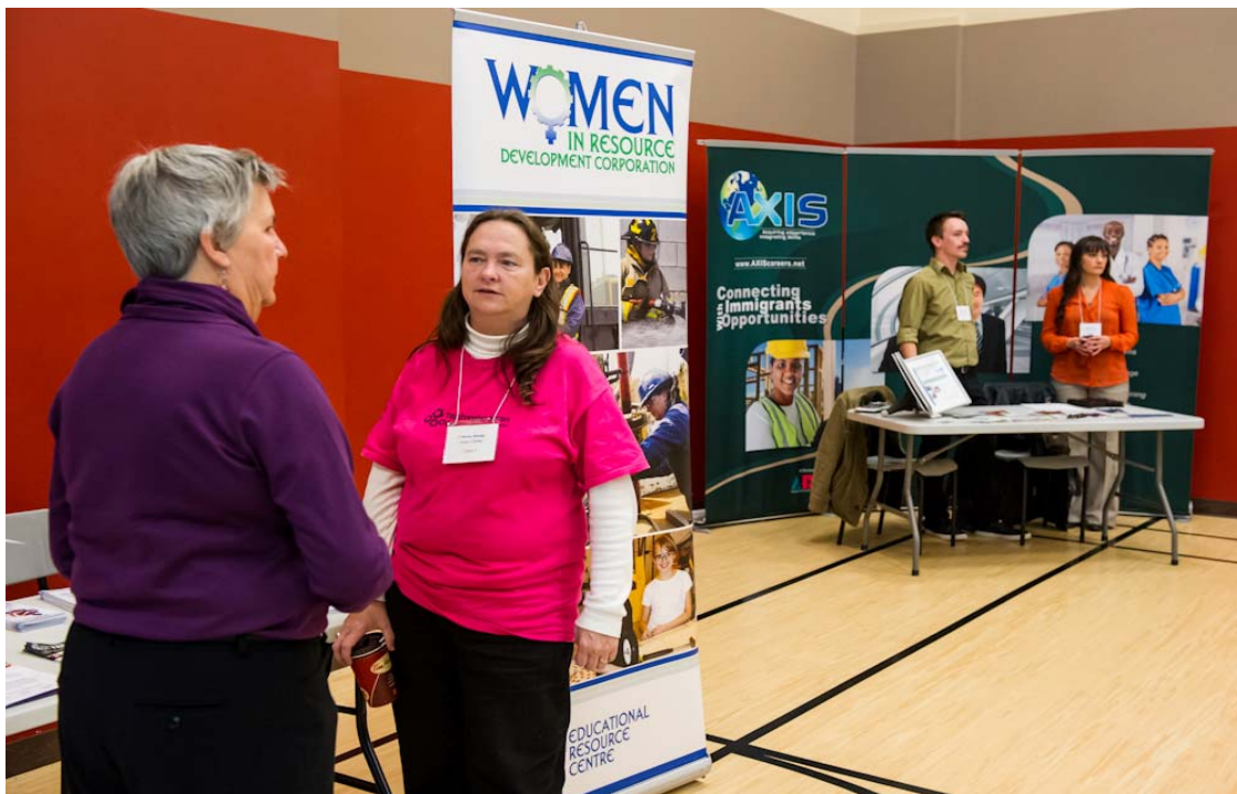
Husky Diversity Forum – November 2012