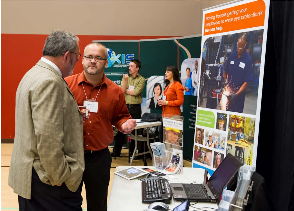
Husky Diversity Forum – November 2012