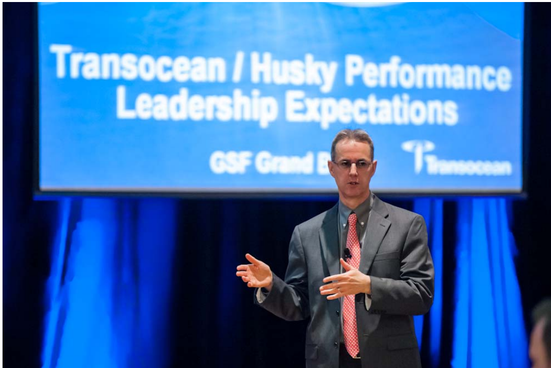
Husky Contractor Safety Forum – December 2012