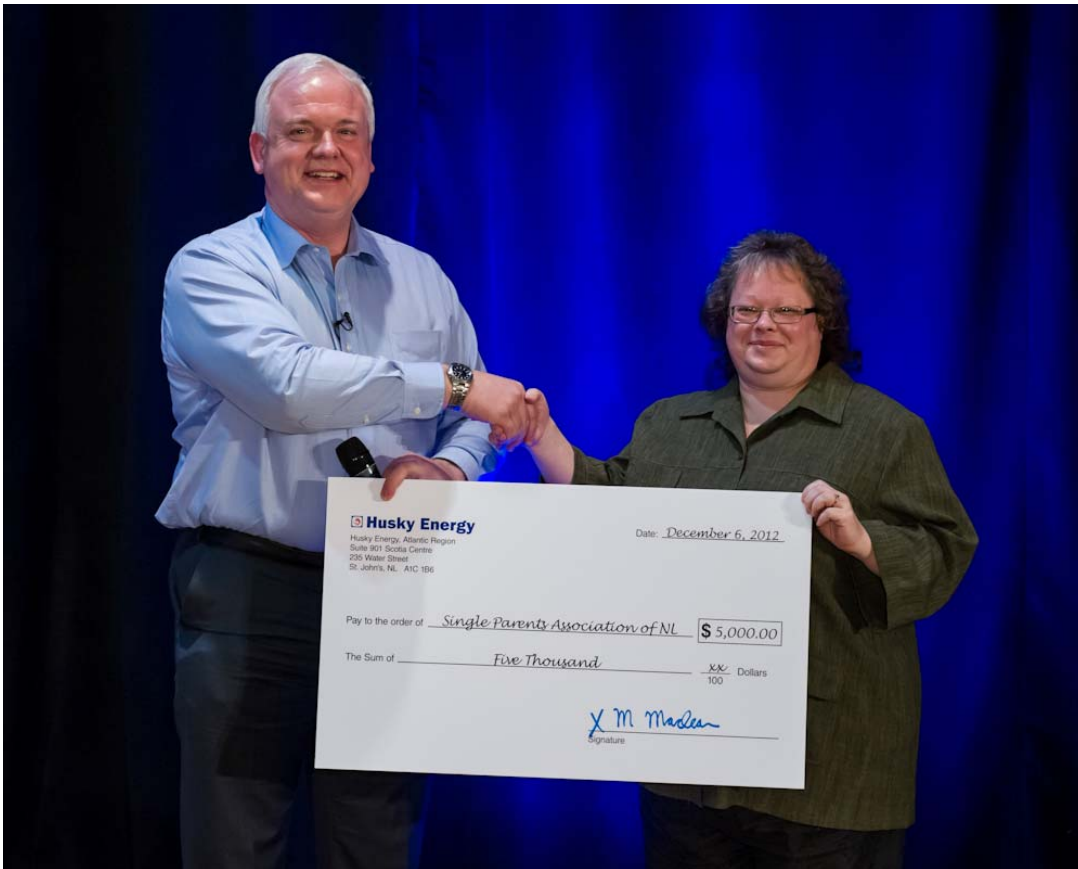
Donation to Single Parents Association of NL – December 2012