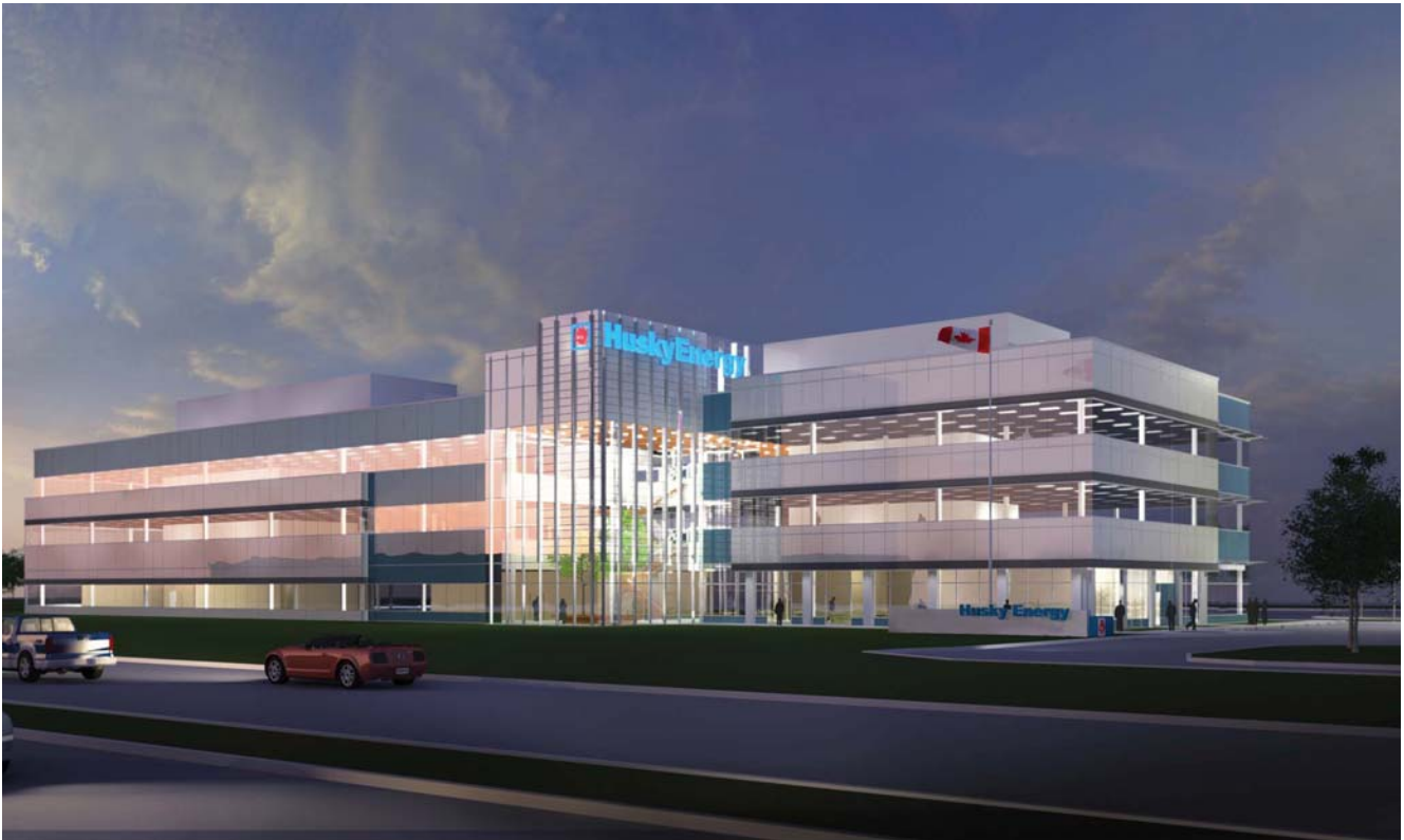
Front view of Husky's new office building to be built near the intersection of Ray Nelson Drive (Highway #16) and 45 th Avenue.