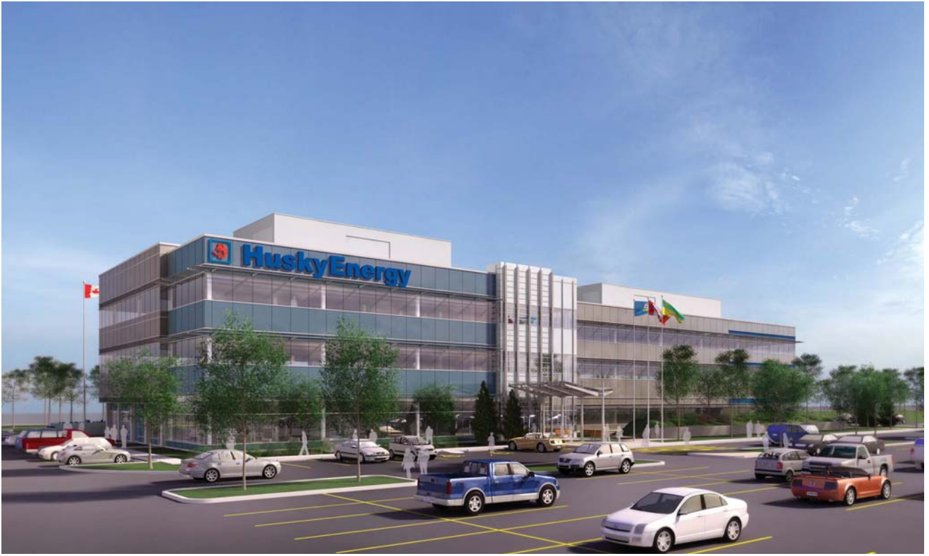
Rear view of Husky's new Lloydminster office building.