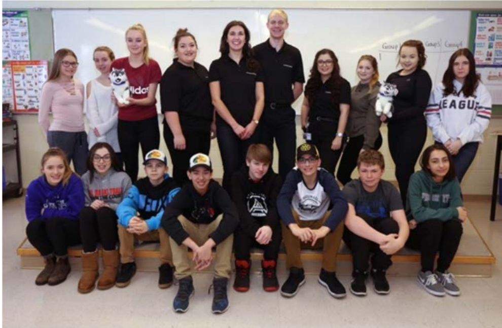
Husky employees volunteer with Junior Achievement at St. Kevin's High School – January 2018