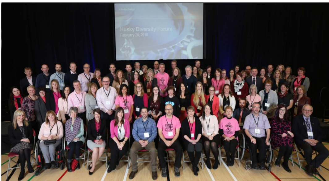
Attendees at Husky's annual Diversity Forum wear pink in support of Anti-Bullying Day – February 2018