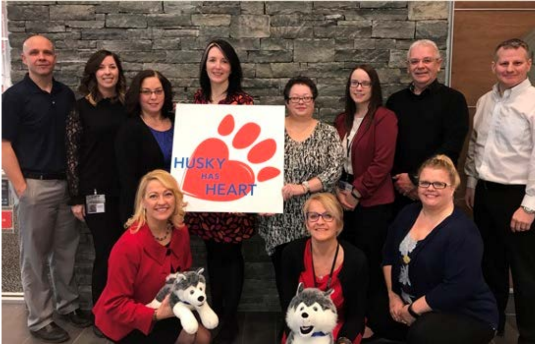
Husky employees raised $25,500 for the Husky Has Heart campaign – the funds were split amongst the Canadian Mental Health Association of NL, Kids Eat Smart, and the Single Parent Association of NL– February 2018