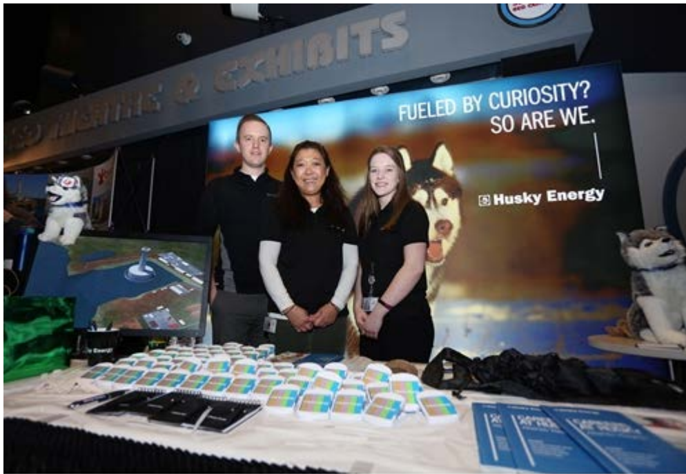
Husky employees attend Oil and Gas week – March 2018