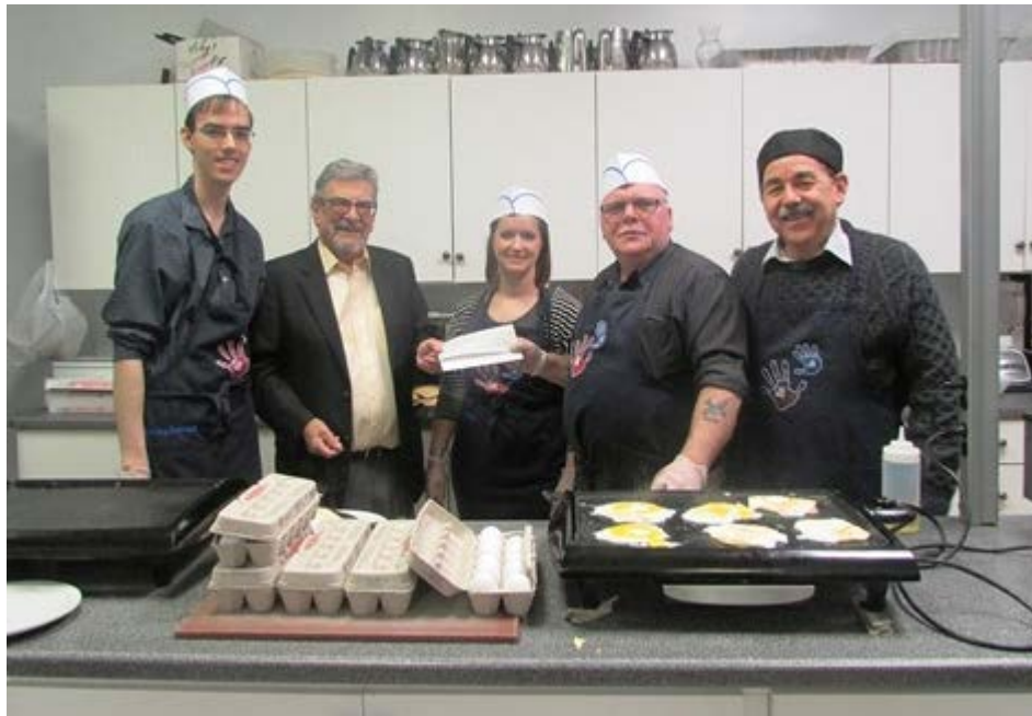
Husky donates $15,000 to the Jimmy Pratt outreach centre breakfast program – February 2018