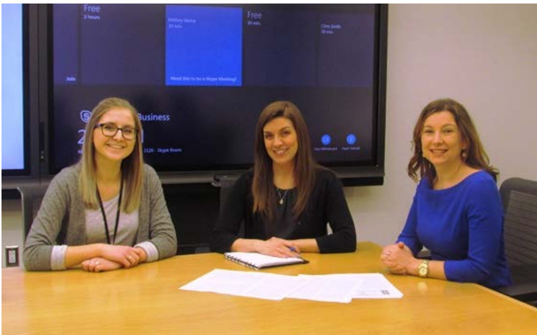
Husky's Women's Leadership Network hosts a mentorship program for work term students – March 2018